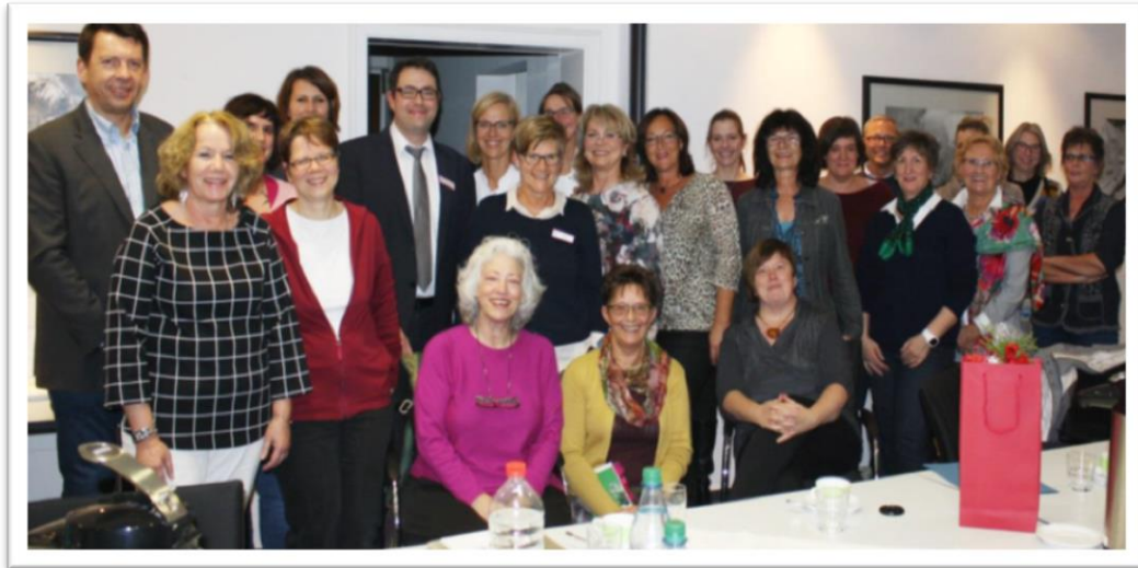
Group of Staff- Members from all Homes and the Hospital, which were certified

The Evangelical Hospital of Bad Dürkheim, Germany received the Validation Certificate of Quality from the Validation Training Institute (VTI) for its special Geriatric unit's excellent work with older adults with cognitive decline. This is the first hospital to develop such a specialized unit and to receive this Certificate of Quality.